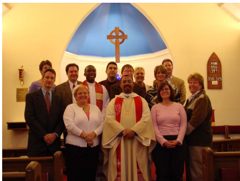
Bishop Gibbs & Members of the Vestry, September 17