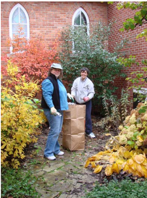
Fall Parish Clean-up