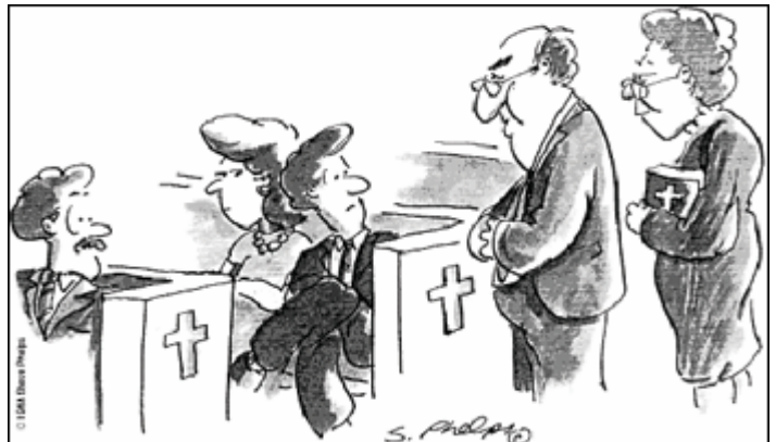
The whole church watched with nervous anticipation as the visitors sat where the Martins have sat for 42 years.

Christ Episcopal Church, 61 Grosse Pointe Blvd. Grosse Pointe, MI 48236